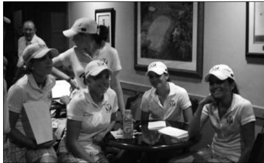
Junior golfers at PING Jr. Solheim Cup in August.